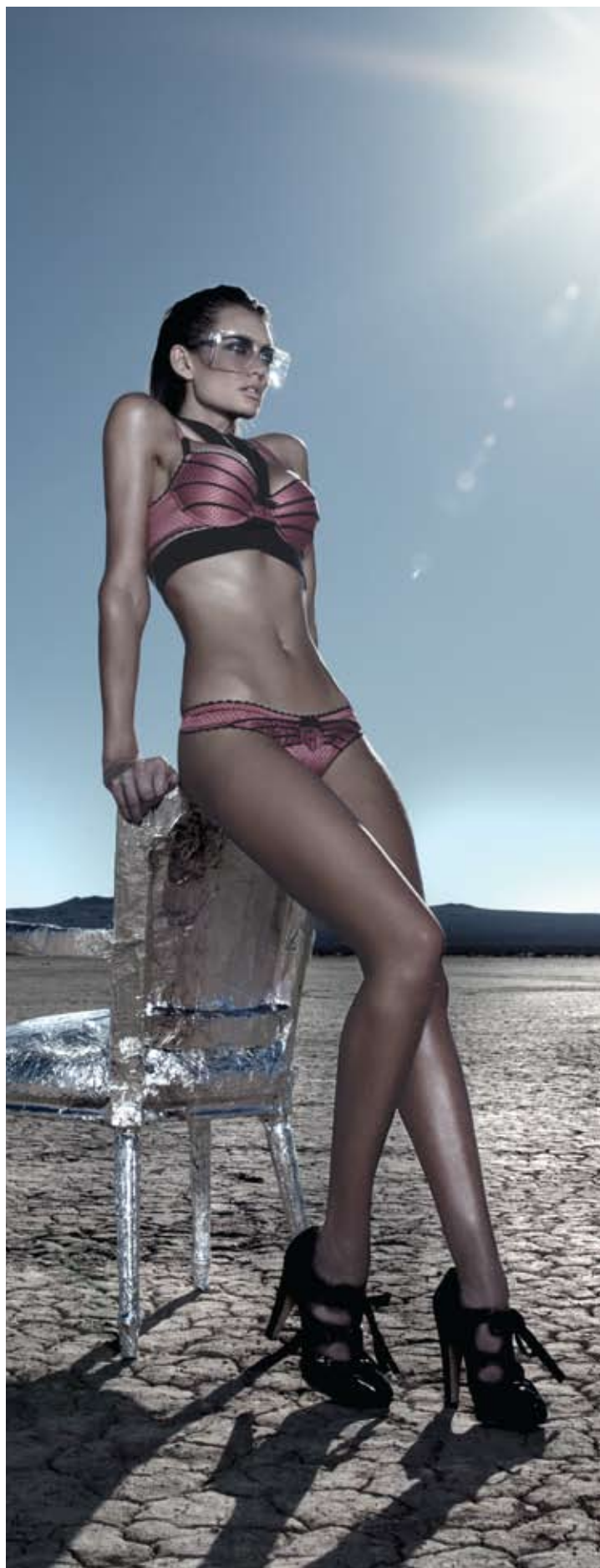
Pleasure State Couture - Astral