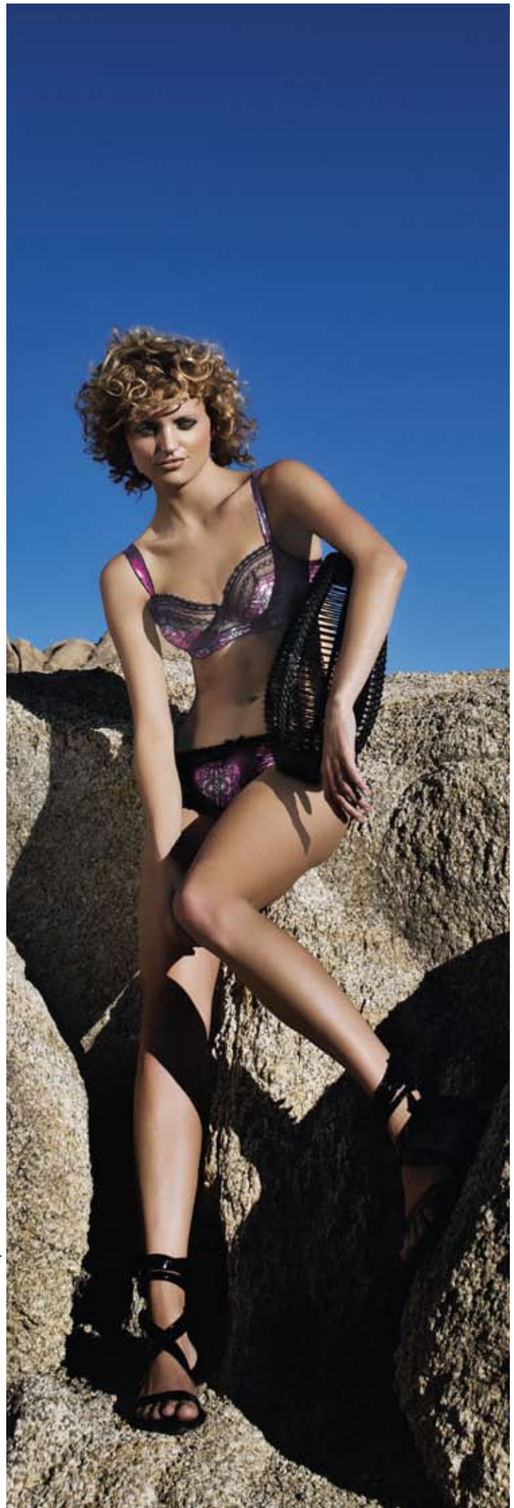
Pleasure State White Label - Spectrum