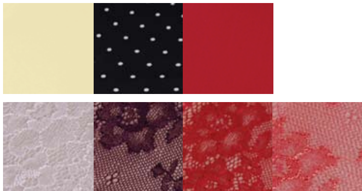
Pleasure State My Fit

This season, Pleasure State My Fit comes in a vibrant selection of tantalizing fashion colours. Amongst the classic shades of white, black, frappe and ecru, comes an exciting blend of Coral, Diamond Pink, Yellow, Infra Red, Black with Spots and Plum.